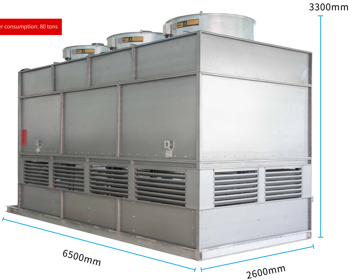
Figure 3-1-6 Dimension of the closed cooling tower