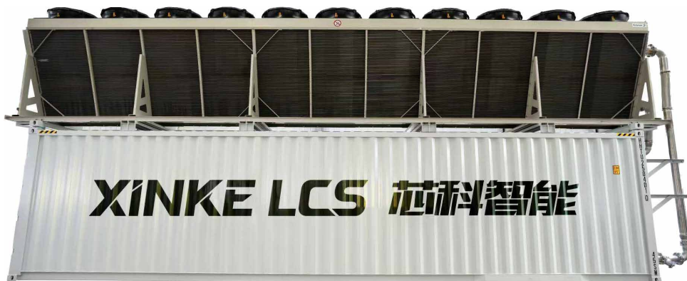
Figure 3-1-1 Appearance of the container