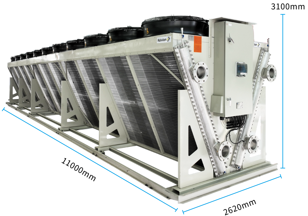
Figure 3-1-5 Dimension of the dry cooling tower