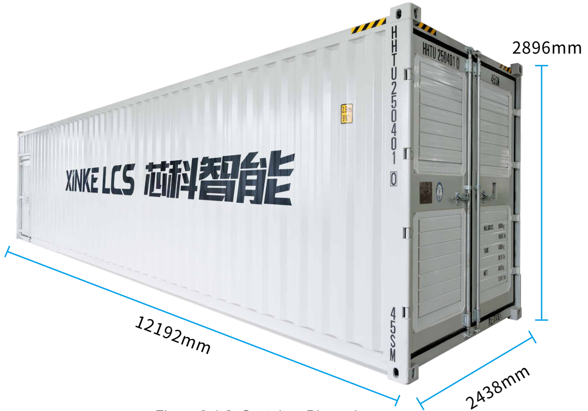
Figure 3-1-2 Container Dimensions