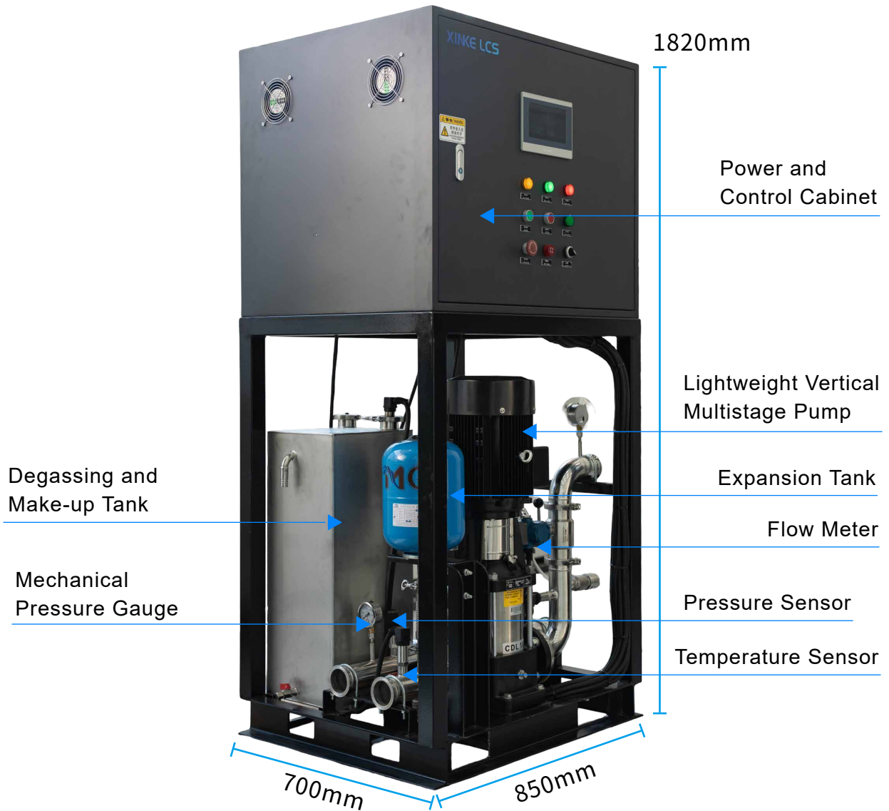
Figure 3-1-5 CDU Explained