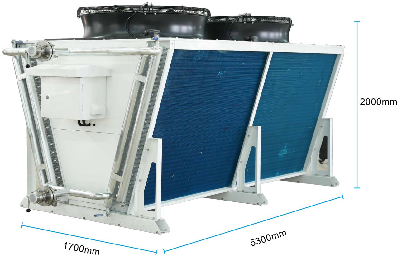
Figure 3-1-6 Dimensions of a dry cooling tower