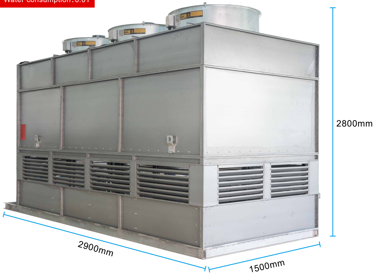
Figure 3-1-7 Dimensions of a Closed-Circuit Cooling Tower