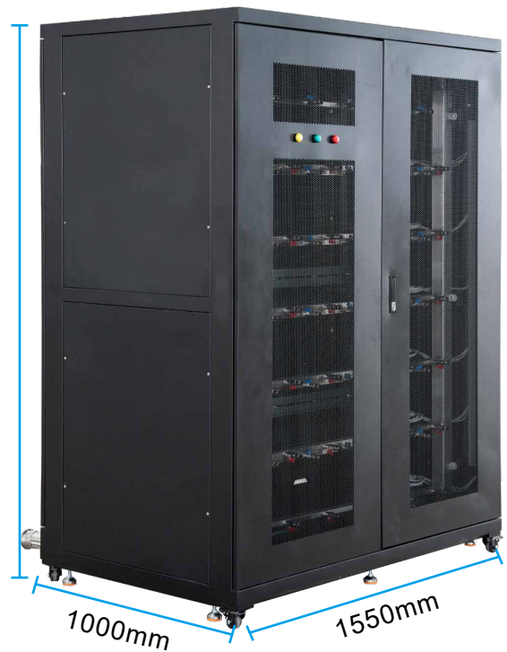
Figure 3-1-1 Appearance of the cabinet