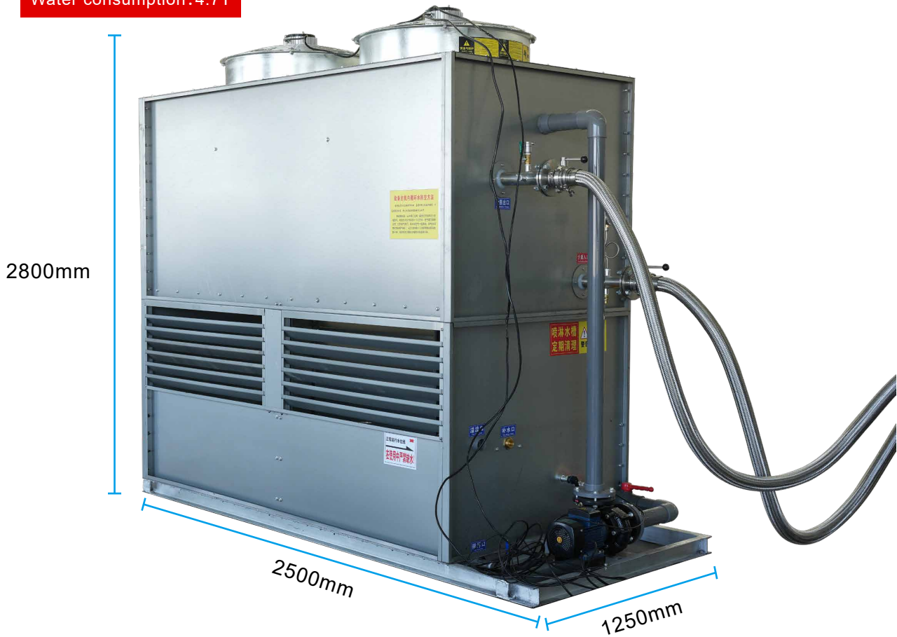
Figure 3-1-5 Dimensions of a Closed-Circuit Cooling Tower