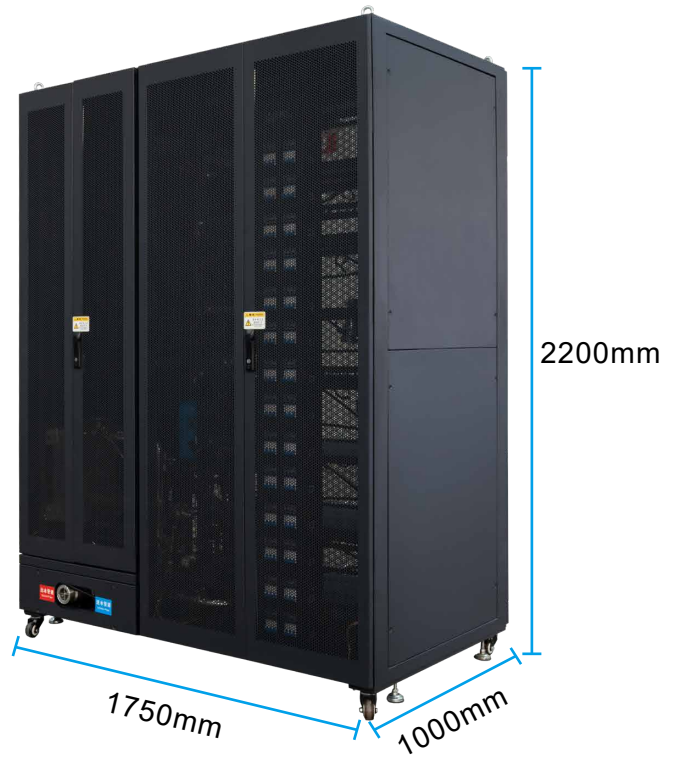
Figure 3-1-2 Cabinet Dimensions