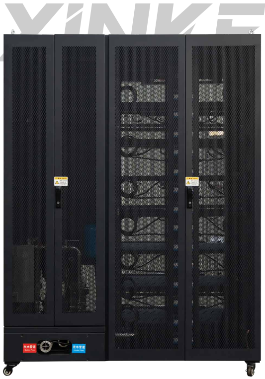
Figure 3-1-1 Appearance of the cabinet