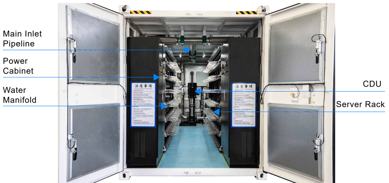
Figure 3-1-3 Internal Layout of Container