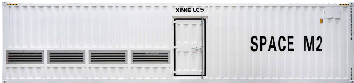
Figure 3-1-1 Container Appearance