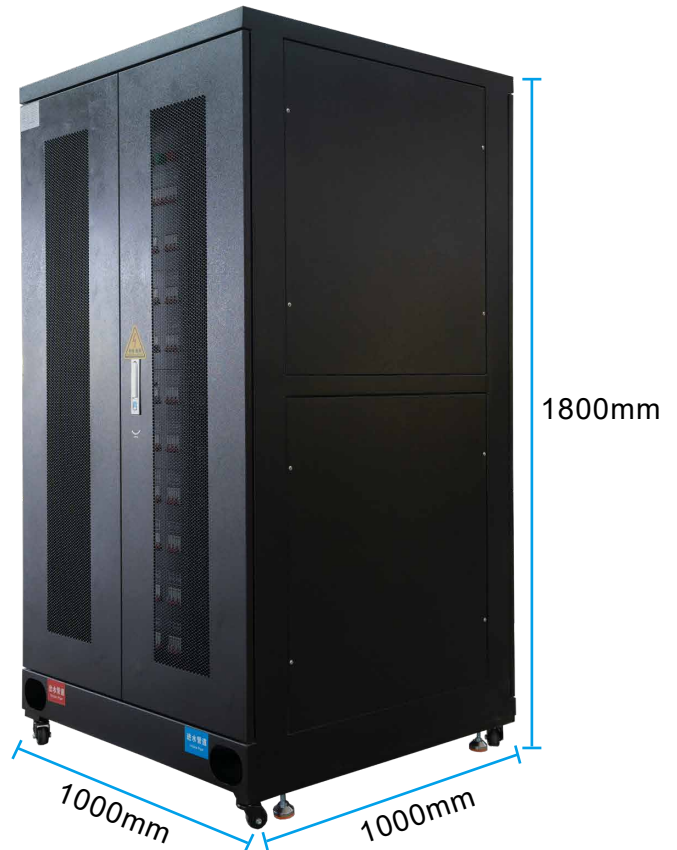
Figure 3-1-2 Cabinet Dimensions