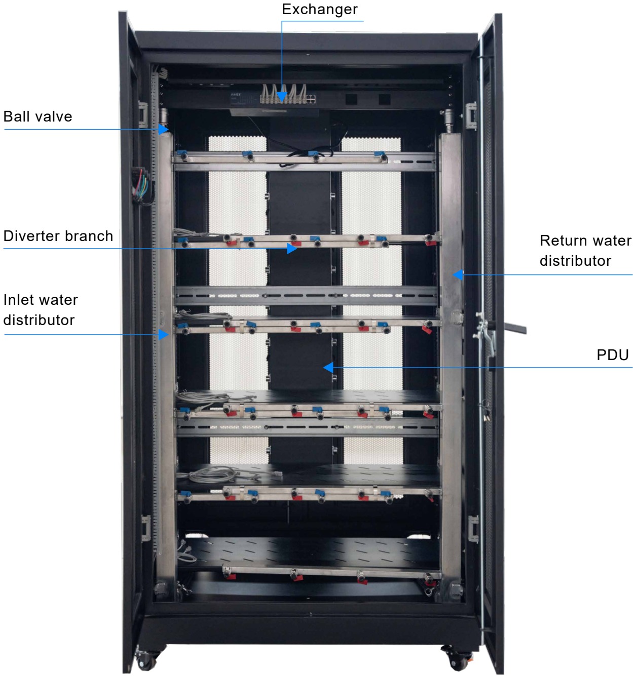
Figure 3-1-3 Internal Layout of the Cabinet