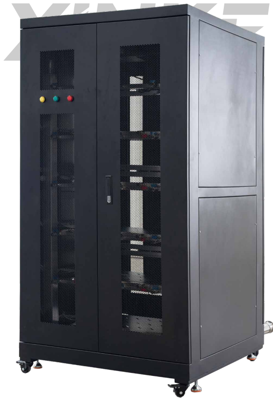
Figure 3-1-1 Appearance of the cabinet