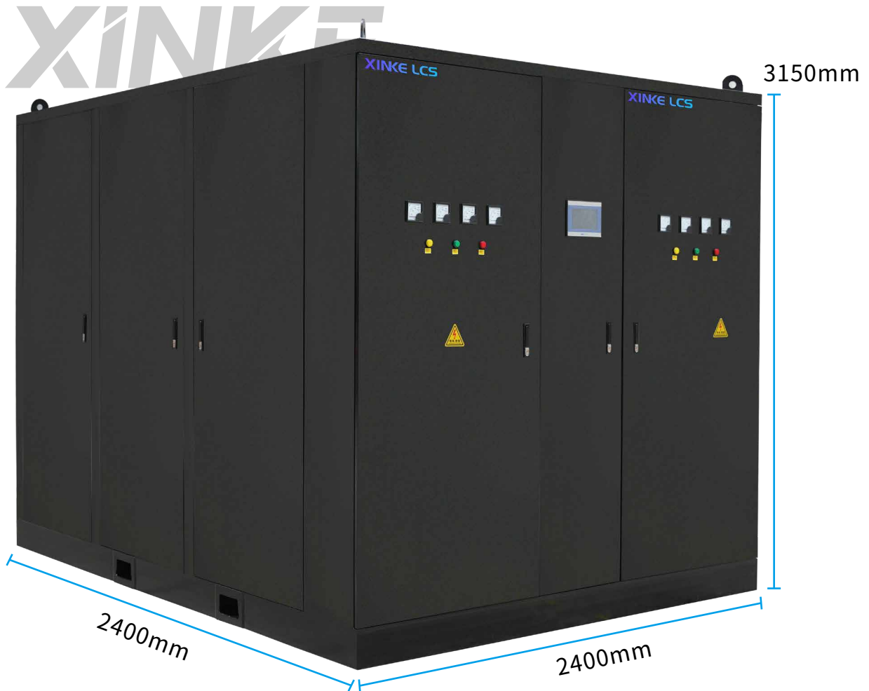
图3-1-1 rack shape and dimensions