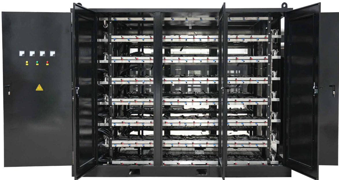
Figure 3-1-2 Interior layout of the rack

Note: The customization of the whole solution of this product can be supported, and the product can be customized according to the needs of the customer's site.