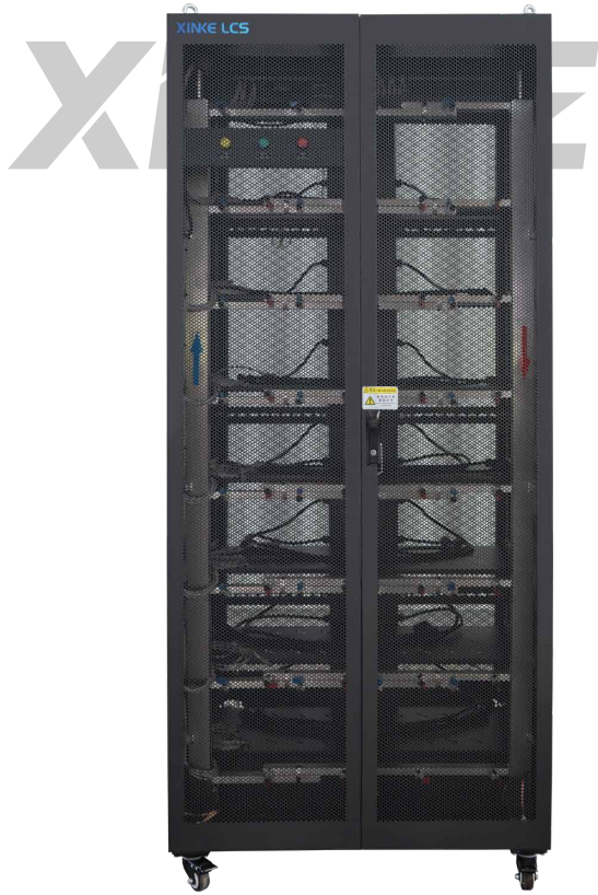
Figure 3-1-1 Appearance of the cabinet