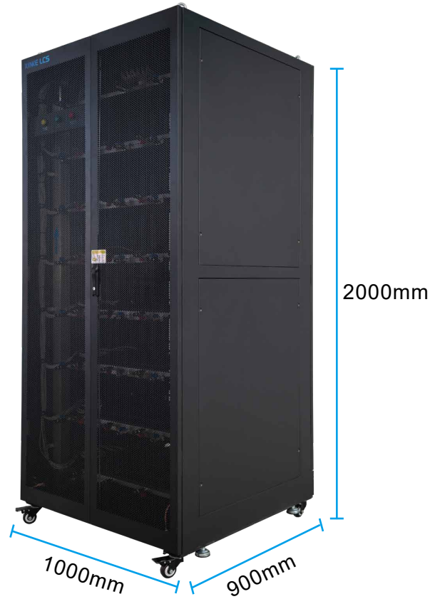
Figure 3-1-2 Cabinet Dimensions