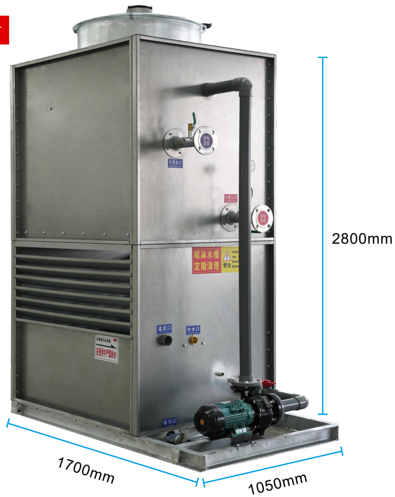
Figure 3-1-5 Dimensions of a Closed-Circuit Cooling Tower