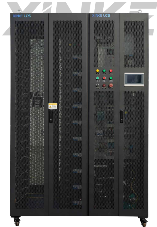
Figure 3-1-1 Appearance of the cabinet