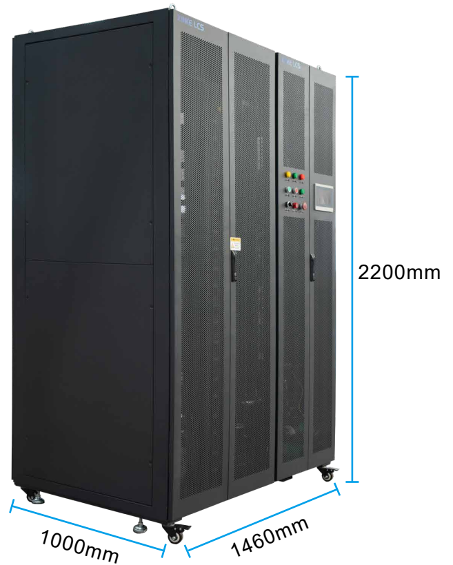
Figure 3-1-2 Cabinet Dimensions