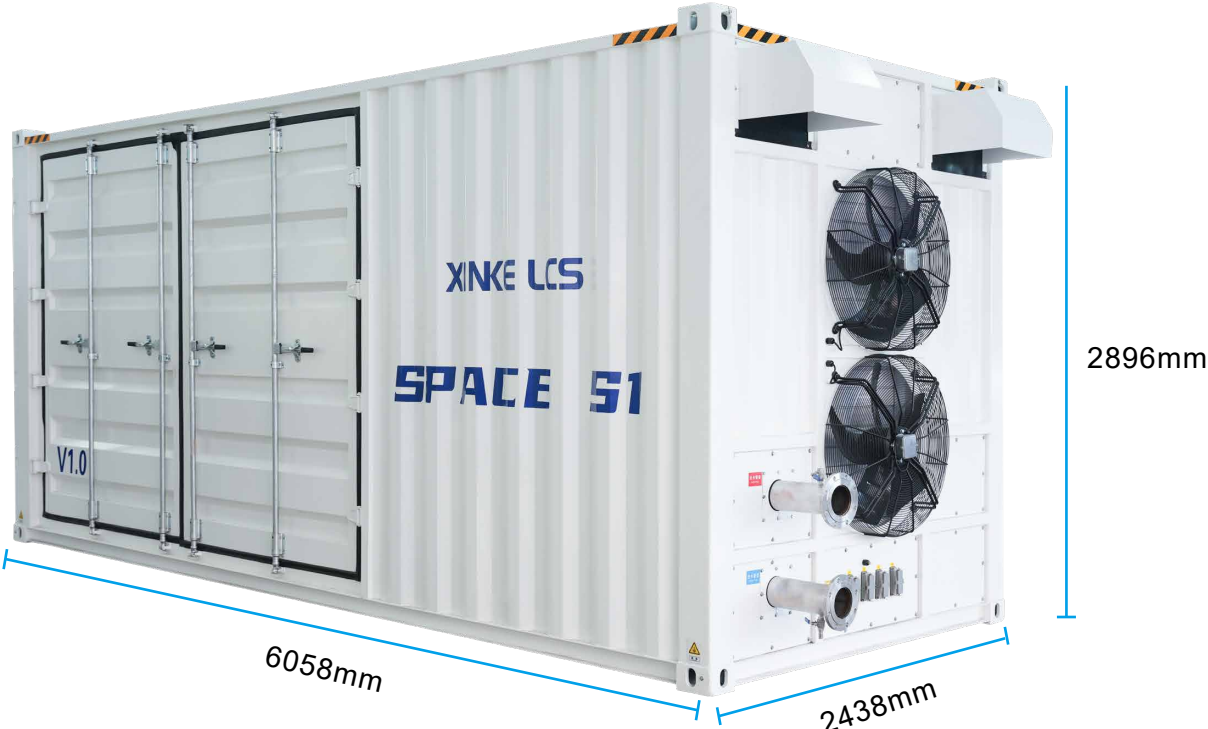
Figure 3-1-2 Container Dimensions