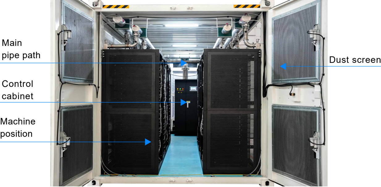
Figure 3-1-3 Internal Layout of Container