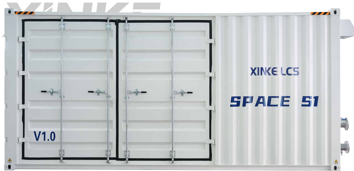
Figure 3-1-1 Container Appearance