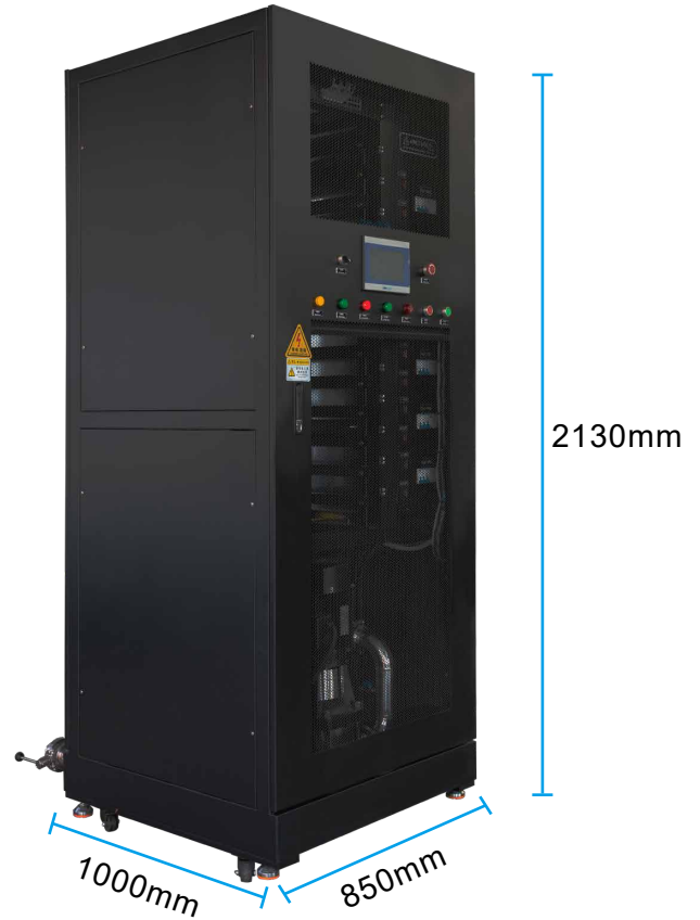
Figure 3-1-2 Cabinet Dimensions