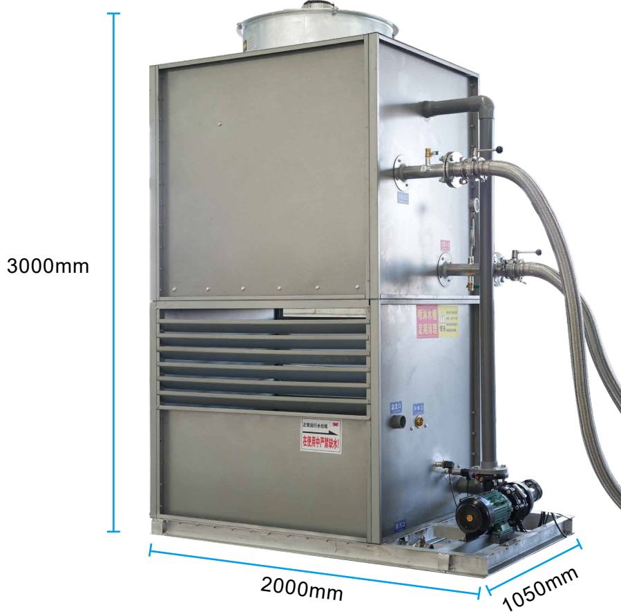
Figure 3-1-5 Dimensions of a Closed-Circuit Cooling Tower