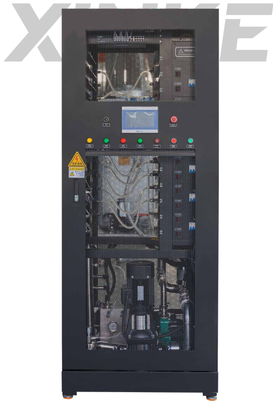
Figure 3-1-1 Appearance of the cabinet