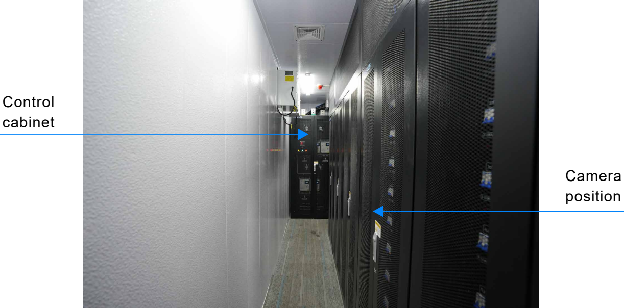
Figure 3-1-3 Internal Layout of Container