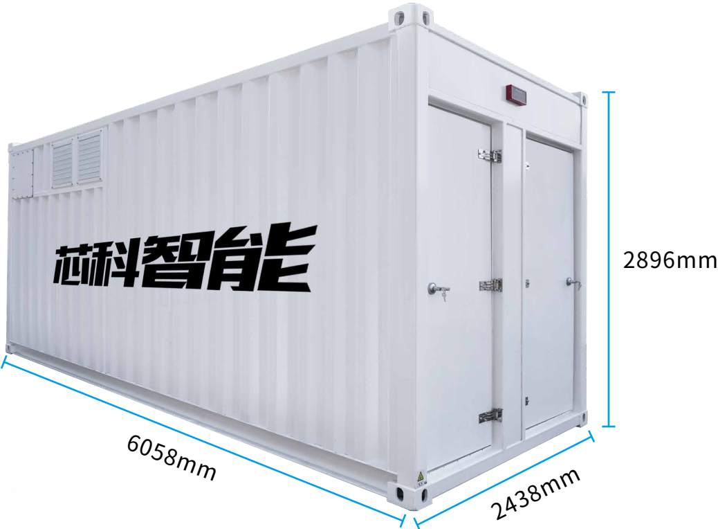
Figure 3-1-2 Container Dimensions