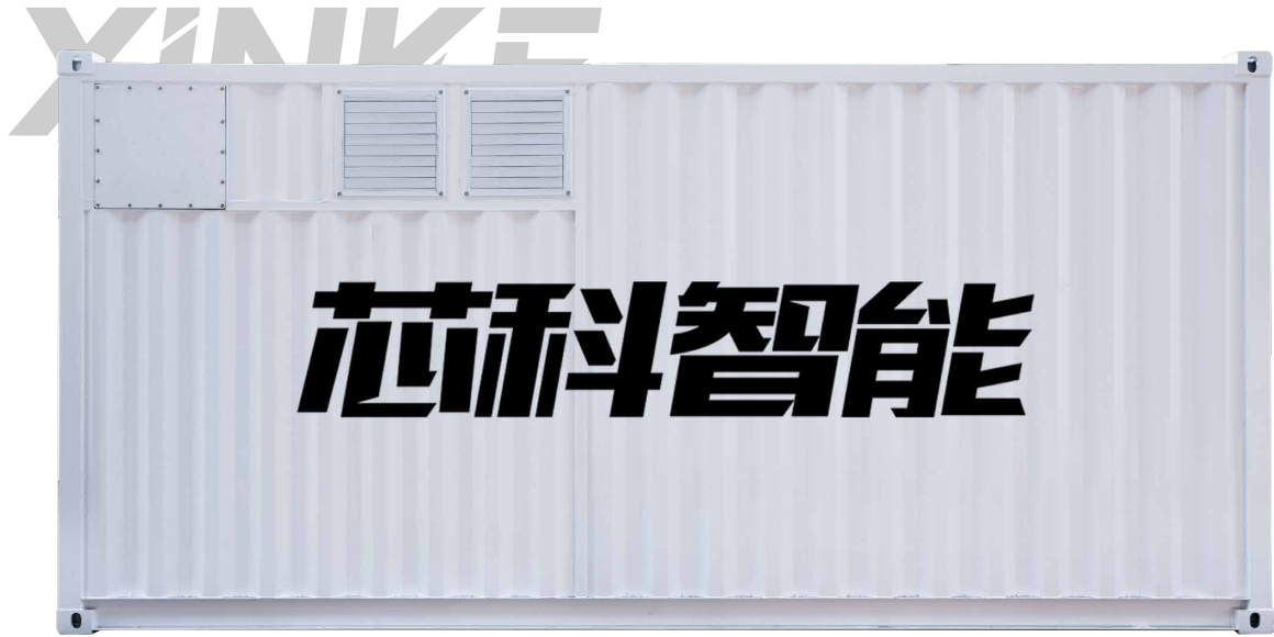
Figure 3-1-1 Container Appearance