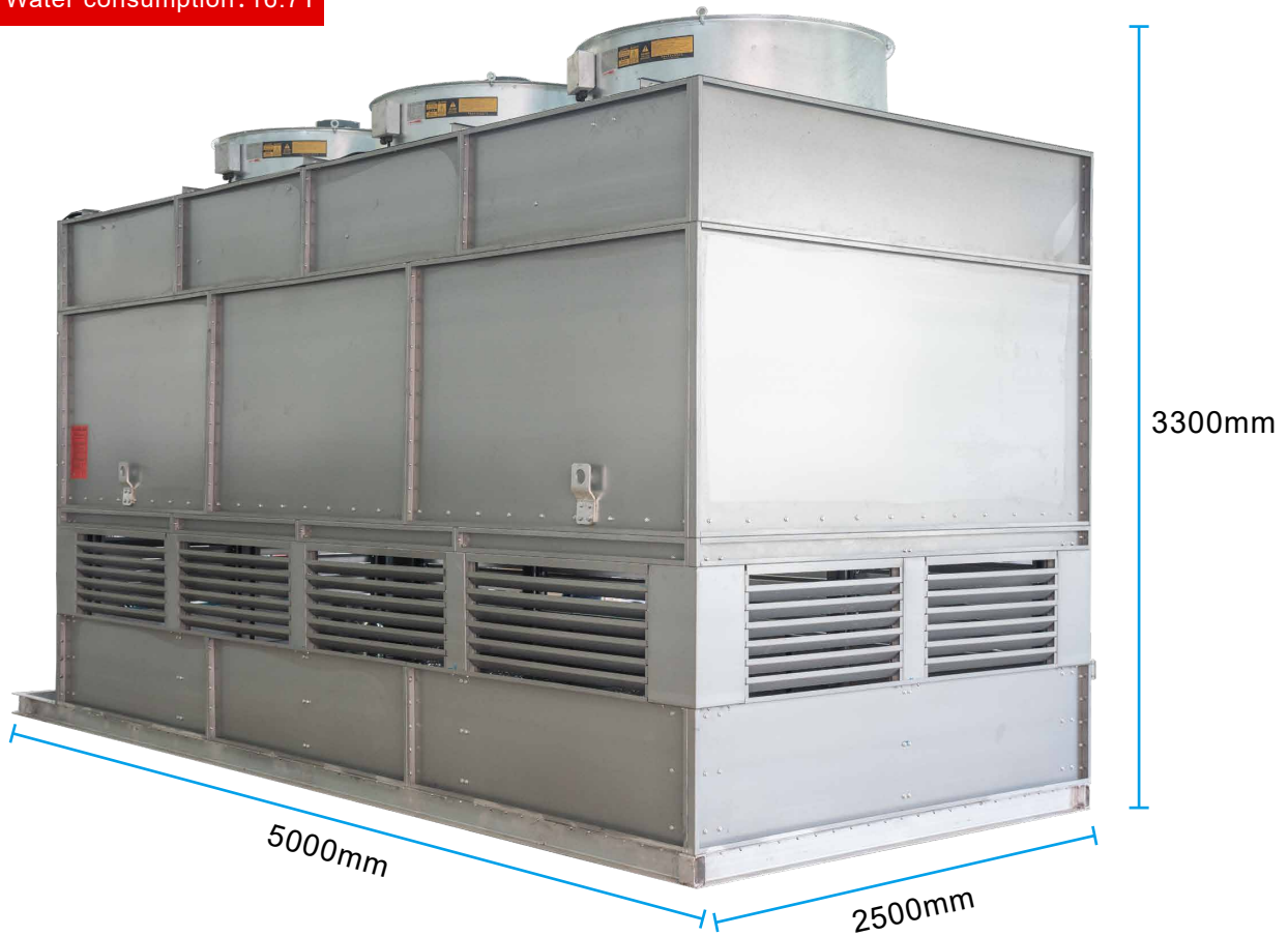
Figure 3-1-6 Dimensions of a Closed-Circuit Cooling Tower