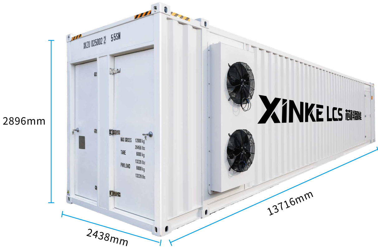
Figure 3-1-2 Container dimensions