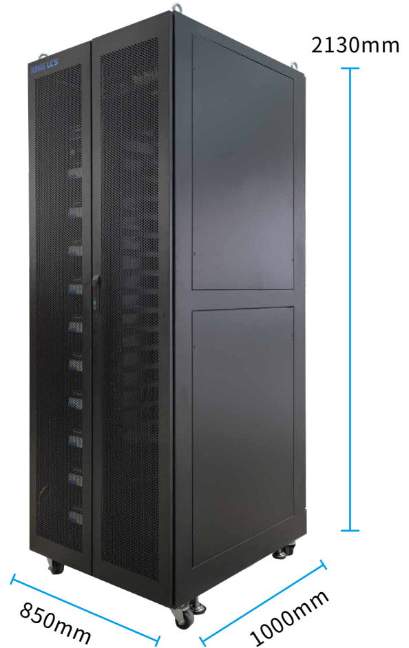
Figure 3-1-2 Cabinet dimensions