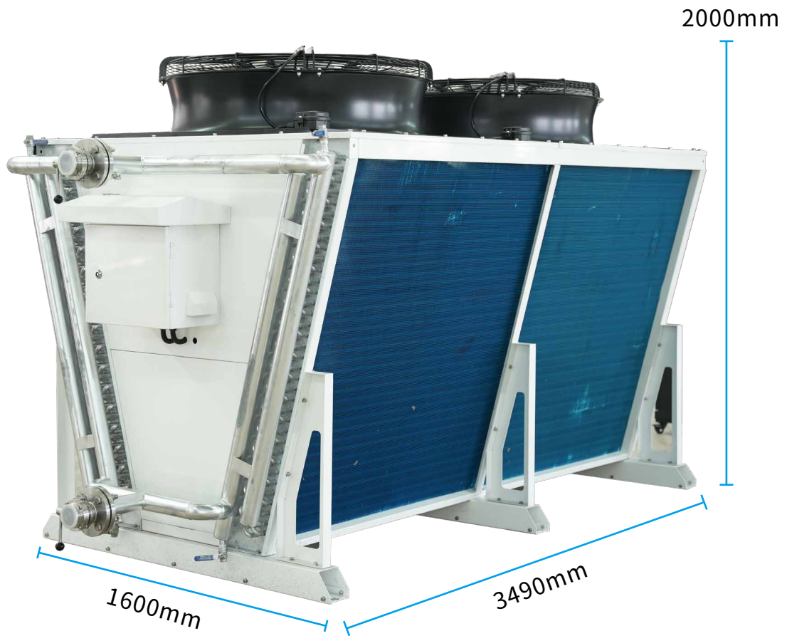
Figure 3-1-6 Dimension of the dry cooling tower