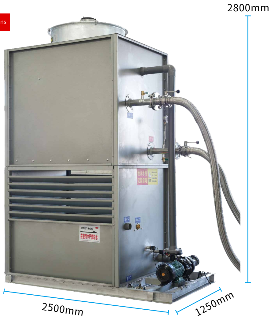
Figure 3-1-7 Dimension of the closed cooling tower