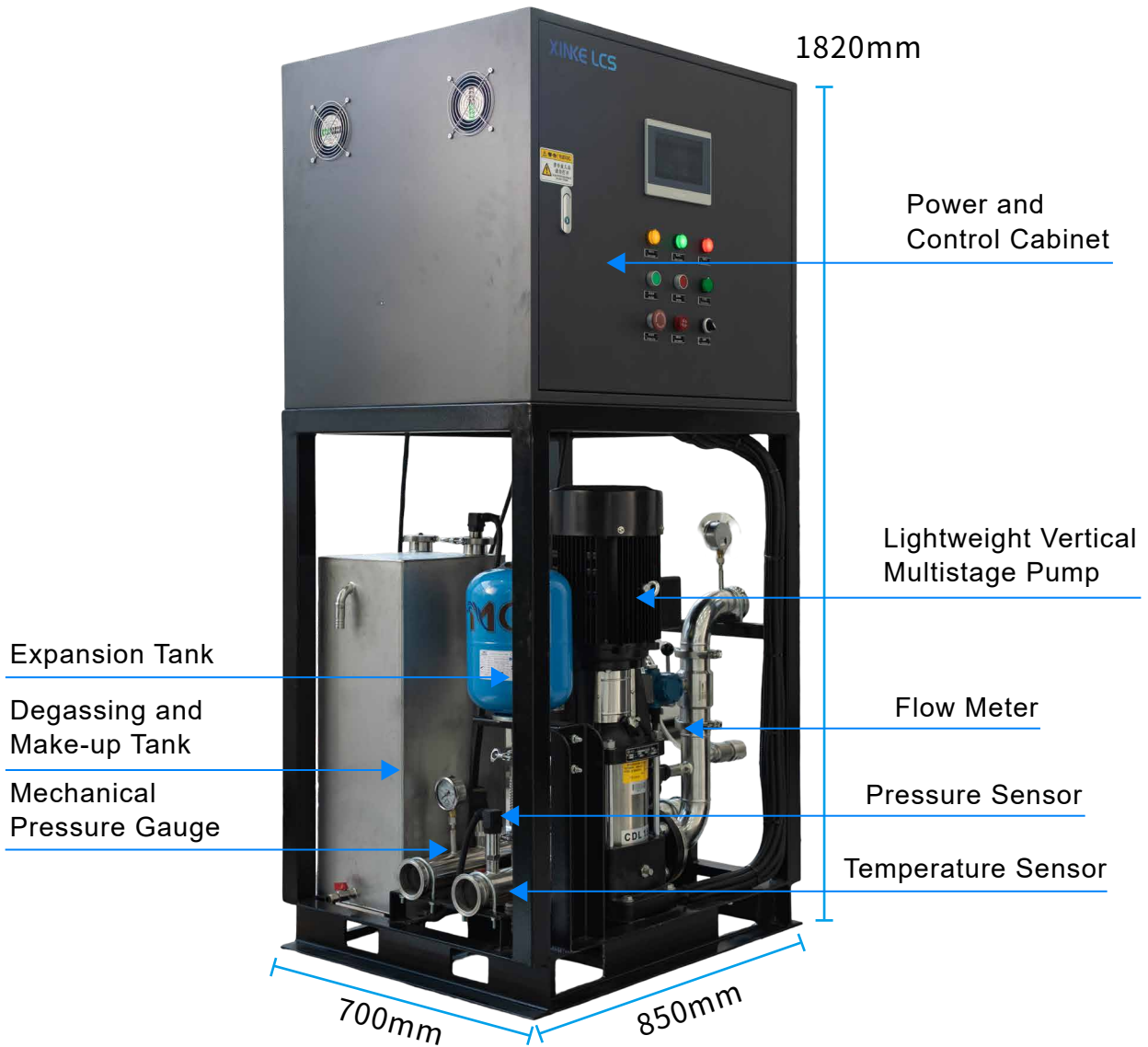
Figure 3-1-5 CDU Explained