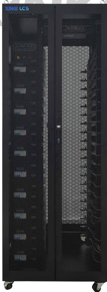
Figure 3-1-1 Appearance of the cabinet