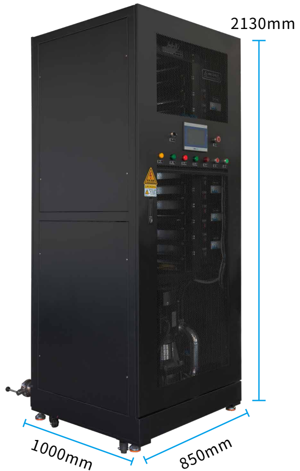
Figure 3-1-2 Cabinet dimensions