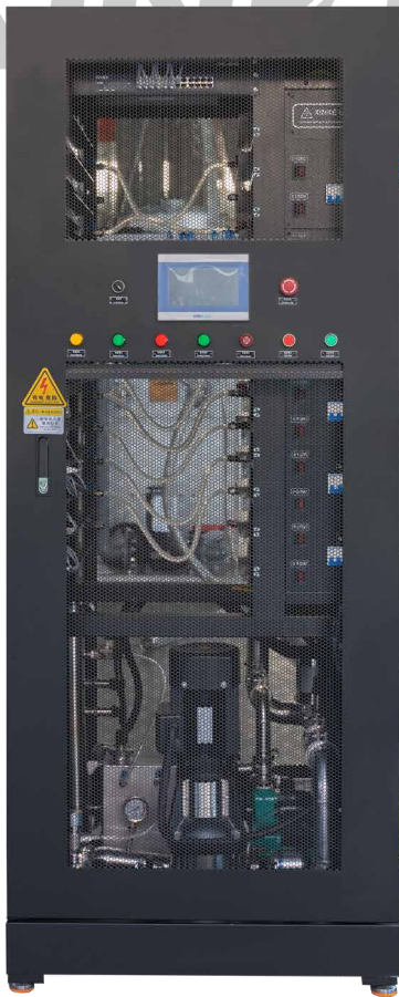
Figure 3-1-1 Appearance of the cabinet